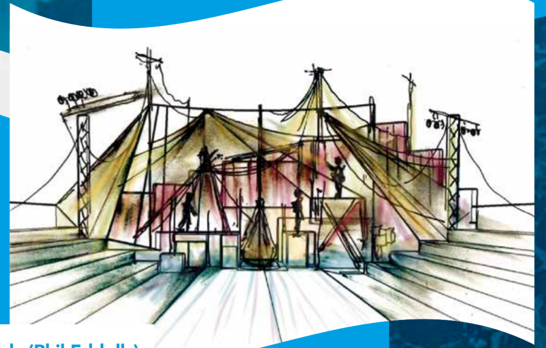
Phleds (Phil Eddolls) Designer

"We need to do Everything In our power To Protect & Restore What we can As if our lives depend upon it Because they do."