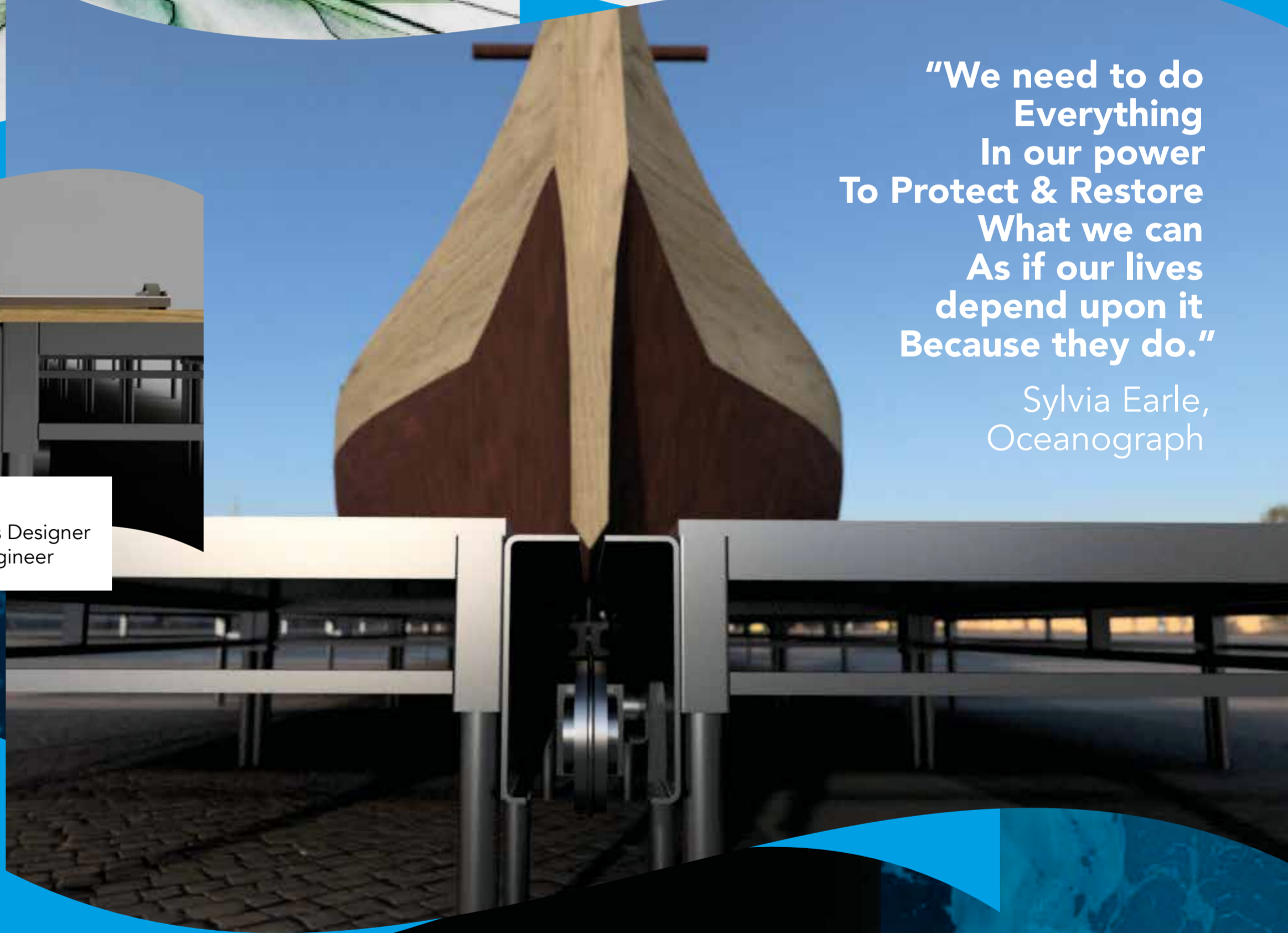
Arnim Friess Lighting & Projection Design